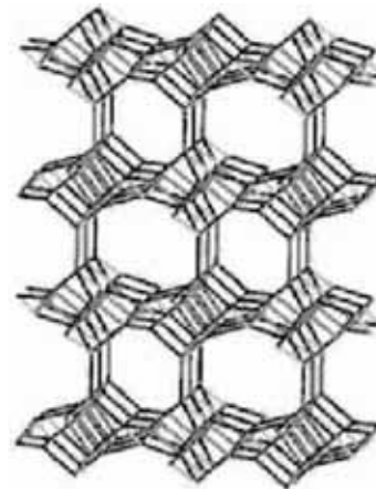
Fig. 1. Crystal structure of the zeolite clinoptilolite with its 8-ring and 10-ring channels.

The empirical formula of a zeolite is of the type: \text{M}_2/n\text{O} \cdot \text{Al}_2\text{O}_3 \cdot x\text{SiO}_2 \cdot y\text{H}_2\text{O} , where M is any alkali or alkaline earth atom, n is the charge on that atom, x is a number from 2 to 10, and y is a number from 2 to 7. The chemical formula for clinoptilolite, a common natural zeolite is: (\text{Na}_3\text{K}_3)(\text{Al}_6\text{Si}_{40})\text{O}_{96} \cdot 24\text{H}_2\text{O}